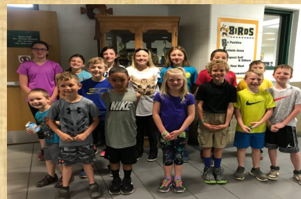
Breakfast with the BIRDS!